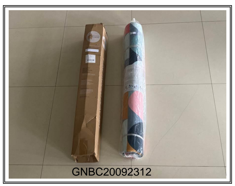
GIG authenticate the photo(s) on original report only